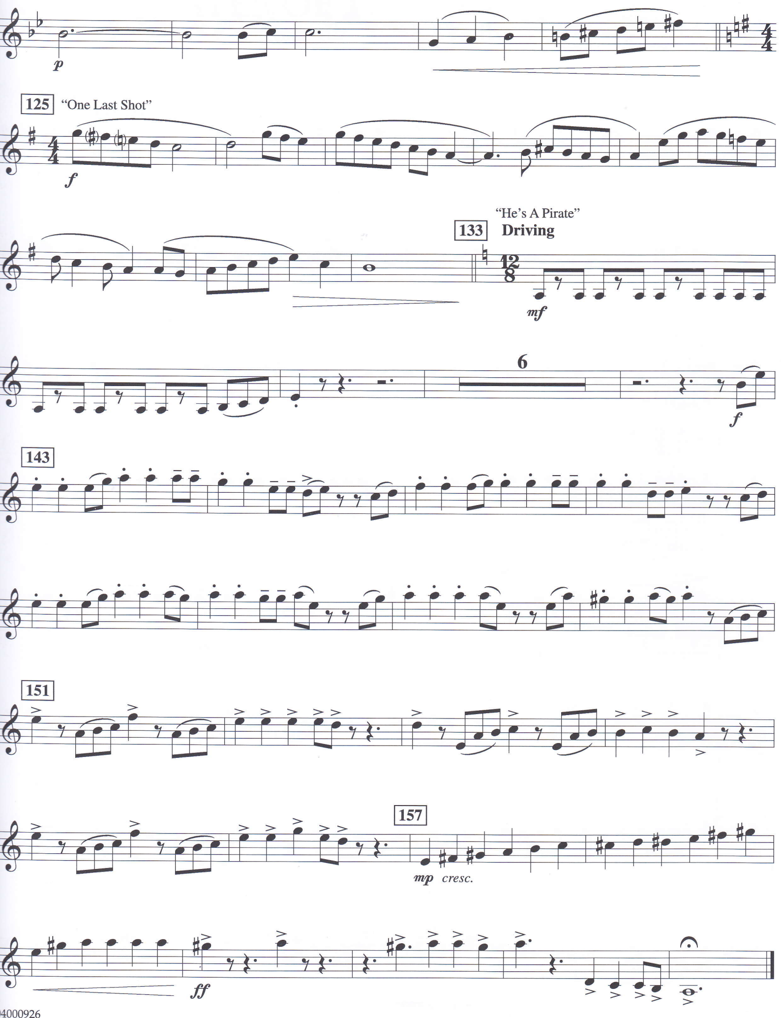
Pirates Of The Caribbean - 3